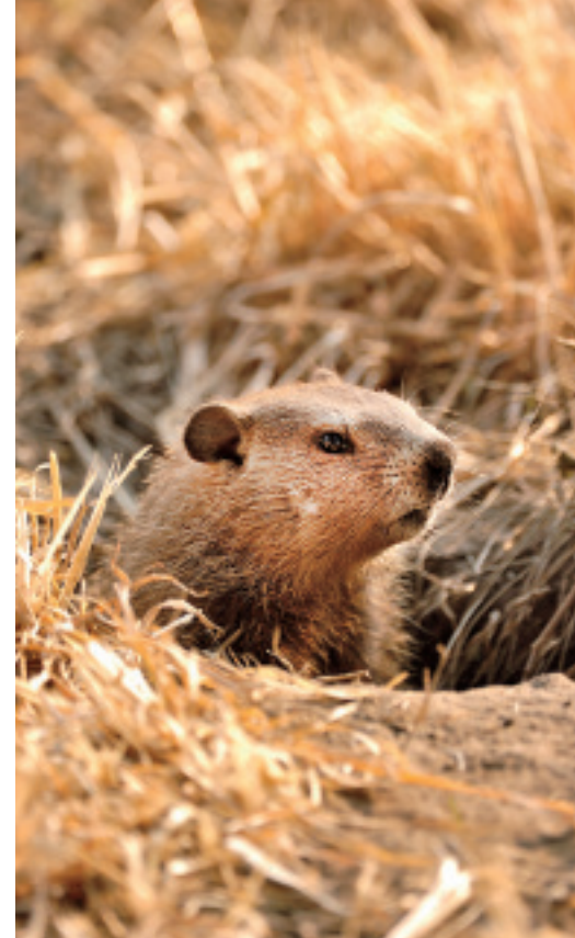
Woodchucks are natural tunnelers that live in burrows.

plants? A burrow in the woods helps shelter the woodchuck from cold winter weather. In summer, trees and bushes are above-ground places to hide from predators.